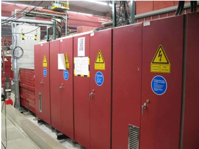
Figure 3: The Bouncer Modulator from FNAL (HV power supply and pulse generating unit in the front, pulse transformer and klystron in the rear)