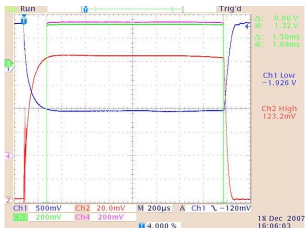
Figure 5: Typical waveforms of one of the new modulators in use at a klystron test stand (Blue: Klystron Voltage: 117kV, Red: Klystron Current: 135A, Green and Magenta: Klystron RF output power 2 times 5MW)

The first modulators made by subsystems manufactured by industrial companies are in operation since 2001. At present PPT has manufactured and delivered nine pulse generating units. A similar number of HV power supplies and pulse transformers have been manufactured by Poynting, FUG and ABB. In case of failure of components repair was mostly possible within several hours or less. Main failures have been caused by broken capacitors in the bouncer circuit or by broken components in the LTT crowbar system. The latter problem is still under investigation. Two times a bouncer main coil broke at DESY in Zeuthen and had been replaced by a bouncer coil of different type with better cooling capability and mechanical improvements. It should be pointed out, that also at these modulators we lost no IGCT switch during normal operation. Just at the early experimental stage two switches were damaged due to false triggering.