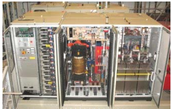
Figure 4: HV power supply and pulse generating unit of one of the new bouncer modulators