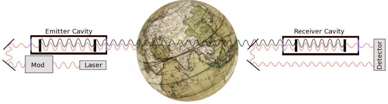
Figure 2: Sketch of the HP communication system. A laser modulated in amplitude or polarization feeds a resonant cavity placed inside a vacuum tube. A fraction of the power inside the cavity oscillates into hidden photons that being weakly interacting scape the cavity and can traverse dense media without losing information. The receiver is another cavity in vacuum locked to the frequency of the HP signal. HPs resonantly reconvert into photons that are finally detected at both the receiver cavity ends.

The emitted hidden photons can traverse any dense medium without significant losses. The hidden photon absorption length in a dense medium with photon absorption length l_\gamma can be estimated as follows (see, for instance [19])