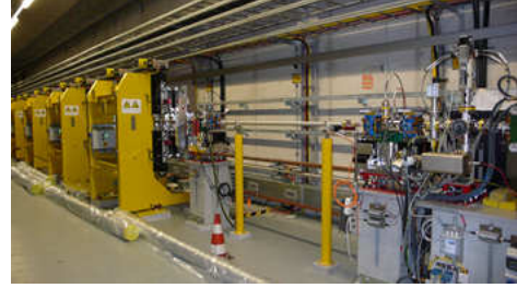
Figure 2: Exit of the SASE undulator section at FLASH2. Two TDS cavities are foreseen to be installed in the free space downstream the undulator.

The SINBAD (Short INnovative Bunches and Accelerators at DESY) facility [12] will be dedicated to accelerator research and development, building upon DESY's recent investment in this area in the framework of the Helmholtz ARD programme. It will be used for experiments in Plasma Wakefield Acceleration, dielectric accelerating structures