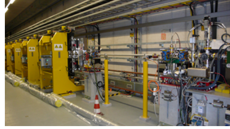
Figure 2: Exit of the SASE undulator section at FLASH2. Two TDS cavities are foreseen to be installed in the free space downstream the undulator.

The SINBAD (Short INnovative Bunches and Accelerators at DESY) facility [12] will be dedicated to accelerator research and development, building upon DESY's recent investment in this area in the framework of the Helmholtz ARD programme. It will be used for experiments in Plasma Wakefield Acceleration, dielectric accelerating structures