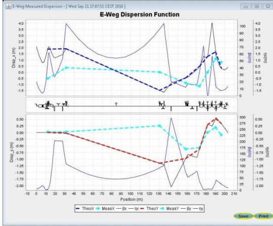
Figure 2: The measured transverse dispersion functions are plotted along with theoretical values.

There are only 3 beam profile monitors which are separated by drift spaces of 55.68m (SM072) and 102m (SM119) from first (SM019), used for beam emittance measurements. The beam profiles are measured using MATLAB utility fitting tools and one of them is shown in Fig.3[6].