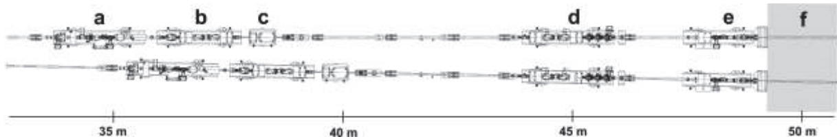
FIGURE 3 Frontend of a canted undulator sector. a: CVD diamond screen and vacuum valve b: vertical slits c: dump magnet d: vert./hor. photon shutter slit system and filter unit e: Bremsstrahlung collimator and beamstop f: concrete shielding wall