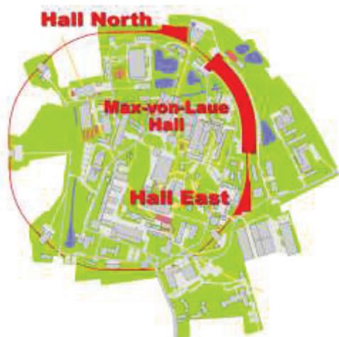
FIGURE 1 Two new experimental halls in the north and the east have been added to the PETRA III storage ring. The initial 14 beamlines are located in the Max-von-Laue hall.

PETRA III is a low-emittance 6 GeV storage ring having evolved from the conversion of the 2.3 km PETRA accelerator into a 3 rd generation light source since 2007 [1]. Today, a total of 14 undulator beamlines with 15 experimental stations operating in parallel for high-brilliance techniques are in user operation in the Max-von-Laue experimental hall which covers 1/8 of the storage ring. In order to extend the experimental capabilities with more beamlines, a major reconstruction started in February 2014 adding two smaller halls in the north and the east of the present Max-von-Laue hall by making use of two long straight sections and part of the adjacent arcs (Fig. 1) [2].