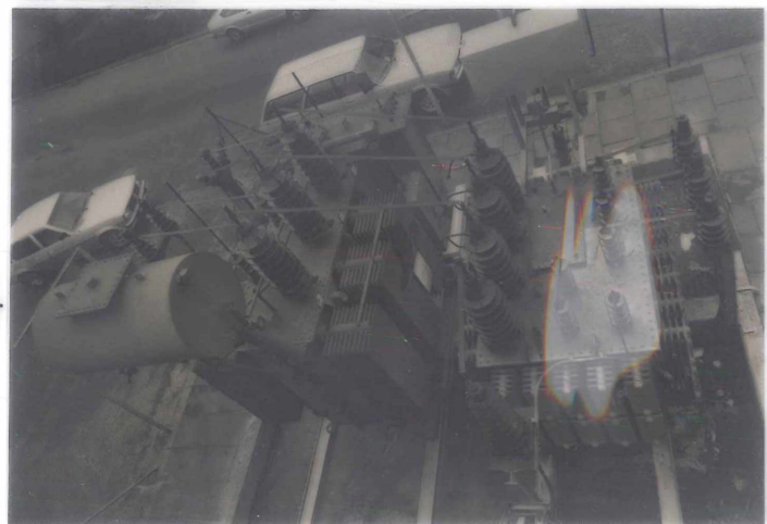
Fig. 1 Open air equipment PETRA I - power supply (SR)

a step transformer on the 10 kV side. The range of voltage is 0.46 to 1.0 U_N and its step voltage 0.04 U_N . The transformer must be set down to the lowest step before switch-on. The short circuit voltage of the transformers was designed to 16 %. As a result of this there are voltage differences of 8 % when changing loads. Transformers, rectifiers and chokes are installed in oil tanks in the open air. (Fig. 1). Filter capacitors, protection equipment and modulator were installed in a high voltage room in the neighbourhood of the klystrons. Cable connections, fittings, insulators and distances were designed according VDE 0111 Reihe 45 standards- Fig 2 in 3) shows the schematic circuit diagram of the installations.