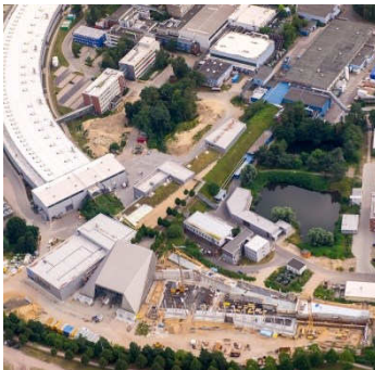
Fig. 1: Aerial View of the entire FLASH facility at DESY including the new tunnel (on the left side) and the new experimental hall (in the lower left corner) in July 2014. The curved PETRA III hall (left) and the construction site of the PETRA extension North (in the lower right corner) are adjacent to the two FLASH experimental halls.

Authors: Bart Faatz and Siegfried Schreiber (DESY Hamburg, Germany)