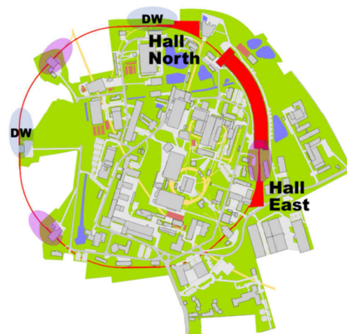
Figure 1: Layout of PETRA III. Two new halls in the North and East have been added.

lines in the Max von Laue experimental hall. The location of the new halls is shown in Fig.1. A detailed layout of the hall North of the PETRA extension is shown in Fig.2. The original plan to reuse the existing accelerator tunnel [3, 4] was not implemented since a new tunnel section is advantageous for the installation of the front end components of the beamlines. The decision to completely reconstruct the tunnel sections was one of the reasons to revise also the project schedule.