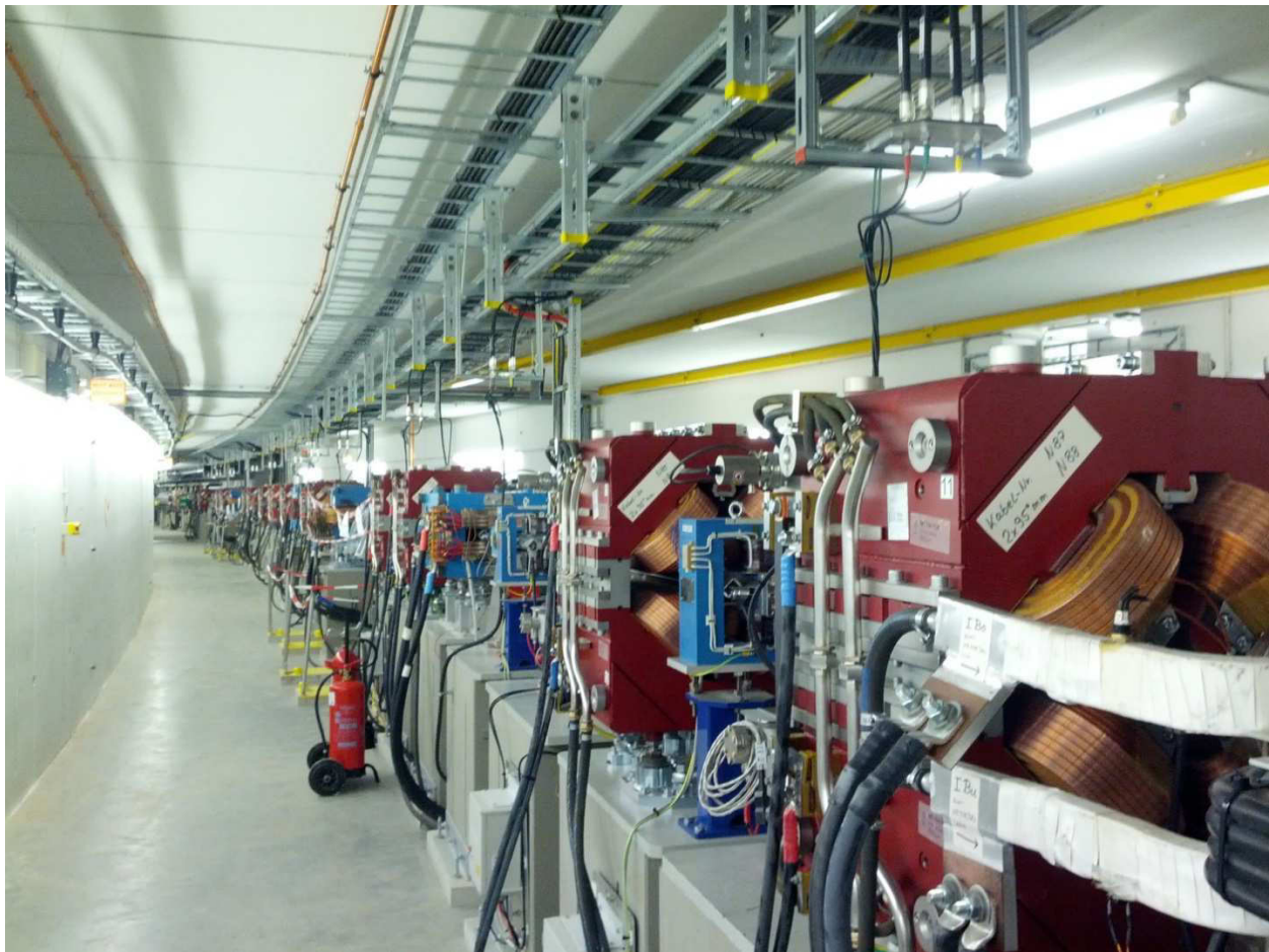
Figure 4: PETRA III extension North. The new DBA like lattice of the extension section North is shown in the photo from April 2015.

The beam quality in the 960 bunch mode has not yet achieved the design values due to ion effects which are degrading the vertical emittance.